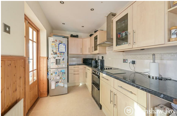
1 Blighmont Avenue | £275,000 Southampton, SO15 8RD